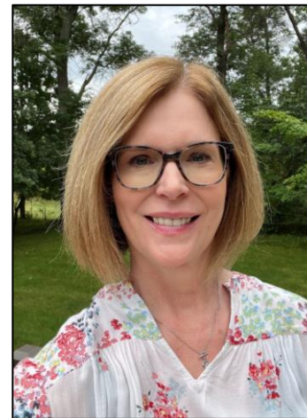
Nominating Committee Vice Chair