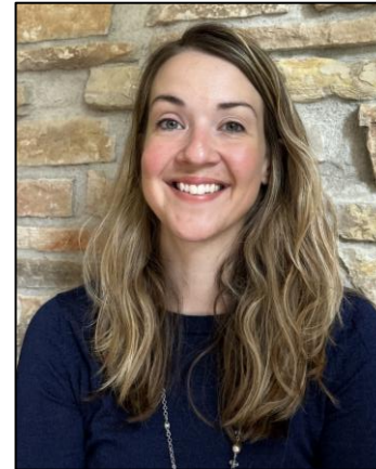
Nominating Committee Chair